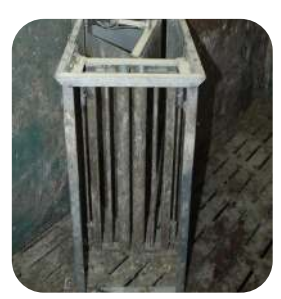
Weighing system on the top of ordisat concept (convenient access)